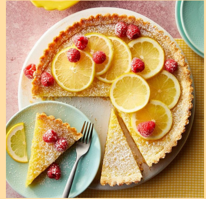
Shortbread Lemon Tart