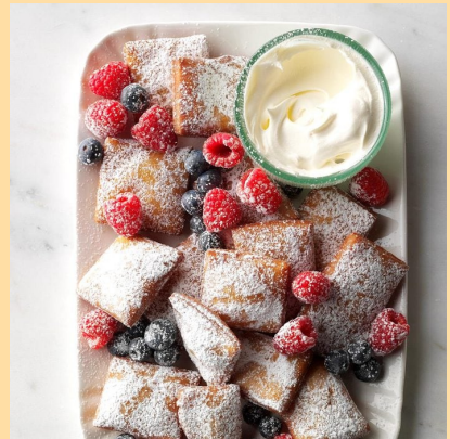
Beignets & Berries