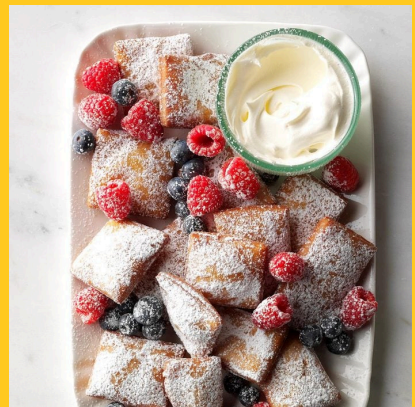
Beignets & Berries