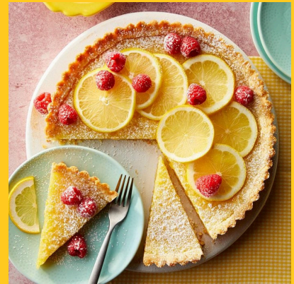
Shortbread Lemon Tart